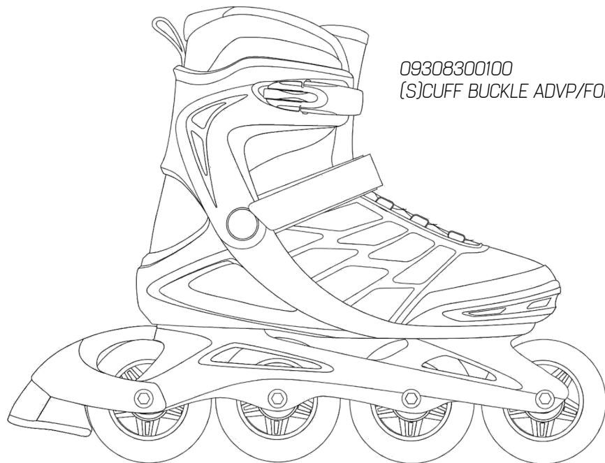
09308300100 (S)CUFF BUCKLE ADVP/FORM(5PRS)